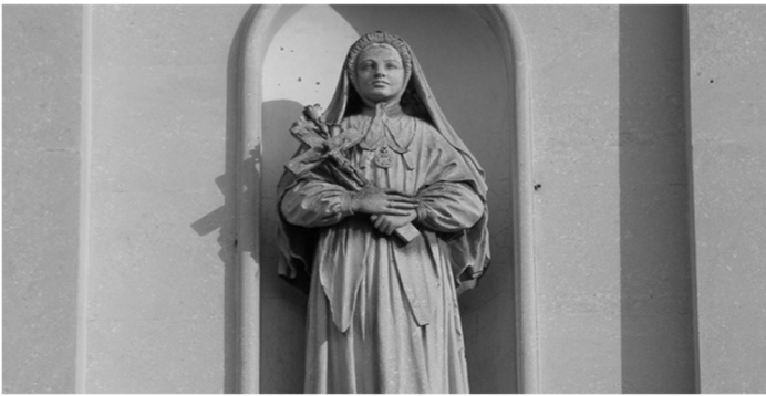
Saint Maria Bertilla Boscardin Saint of the Day for February 26