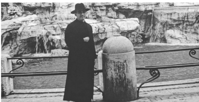
Saint Oscar Romero