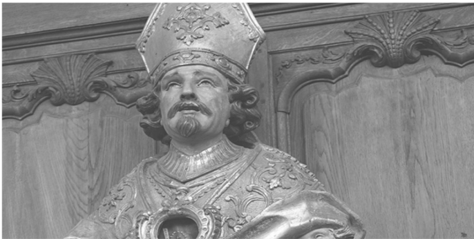
Saint Hilary of Poitiers Saint of the Day for January 13